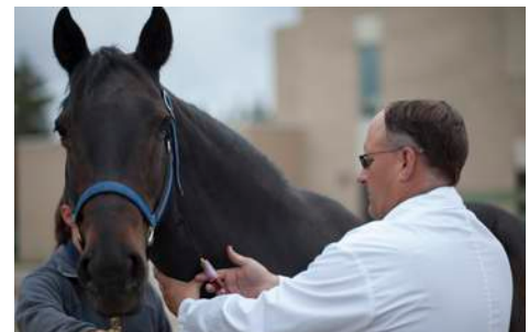
Veterinarians draw and test blood to determine if a horse carries the EIA virus.

Large biting insects and contaminated needles are the most common sources of EIA infection.